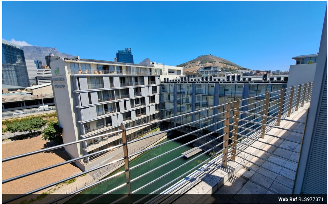
Web Ref RLS977371

Ratcatchers Building W Quay Rd Victoria & Alfred Waterfront Cape Town 8001