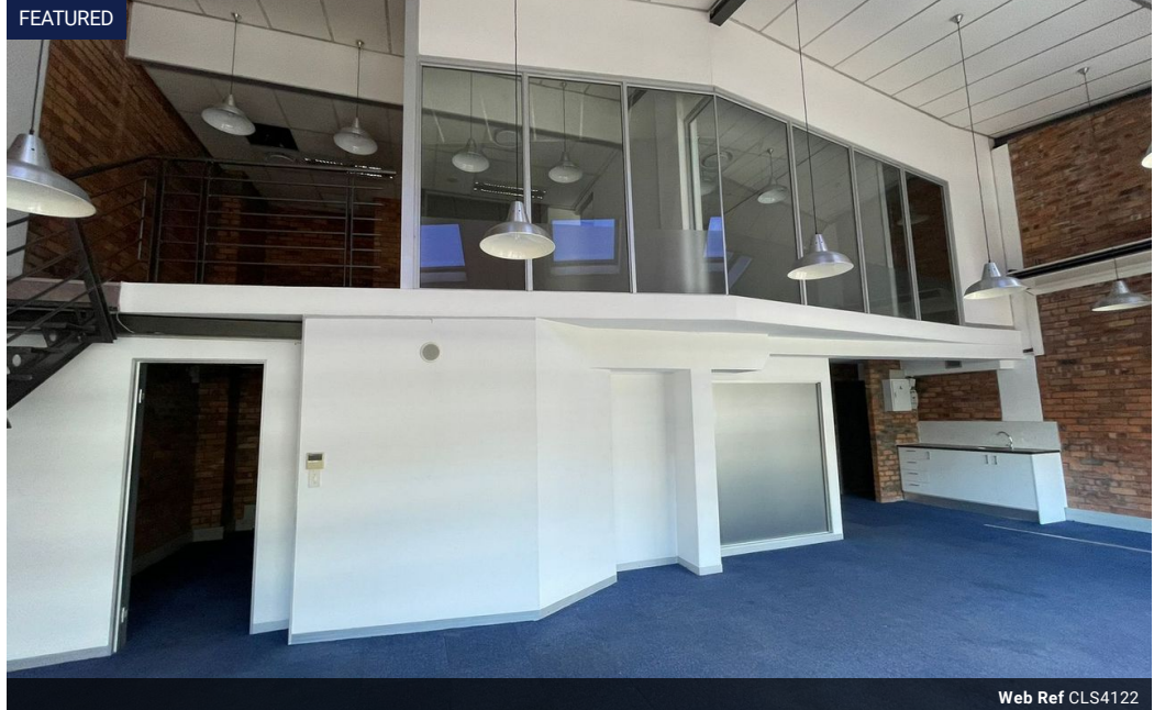
Web Ref CLS4122

Unit 64, Palmhof Centre, 24 Union St, Gardens, Cape Town, 8001